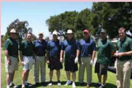
R.E. Wacker Associates - French Cup '10