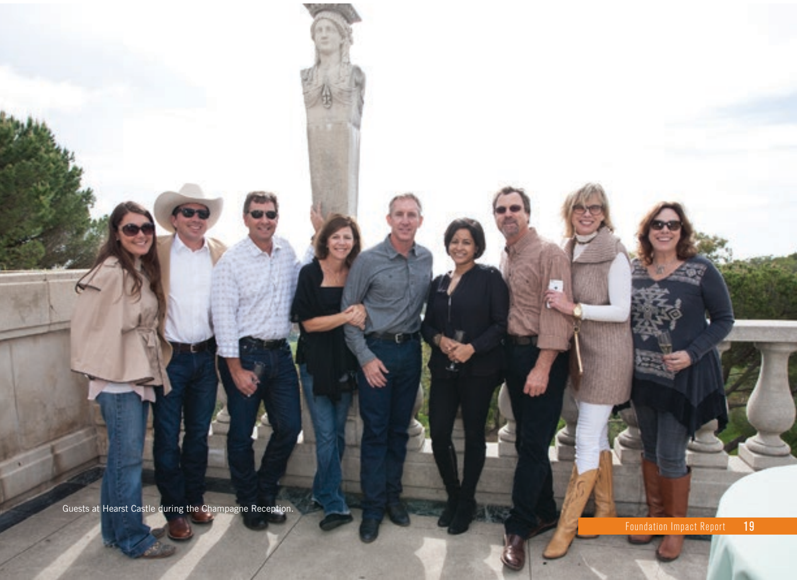
Guests at Hearst Castle during the Champagne Reception.