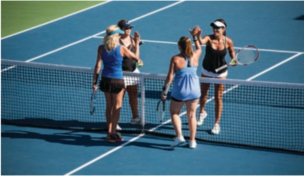
Women's doubles tennis teams congratulate each other after a well-played round of tennis during the French Cup.