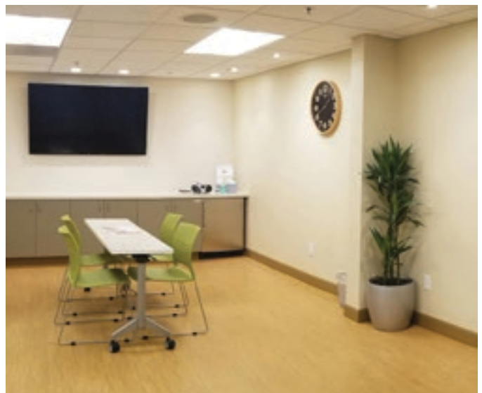
The new multipurpose room in the Hearst Cancer Resource Center.

This project was 100 percent funded by contributions from generous donors at the 2016 Share the Hope event.