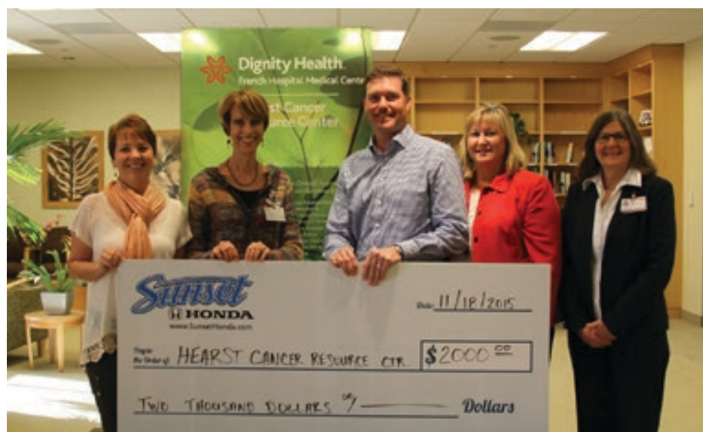
Sunset Honda presents a check to the Hearst Cancer Resource Center for $2,000.