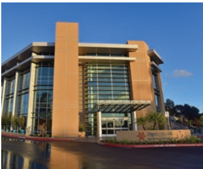
The Copeland Health Education Pavilion.