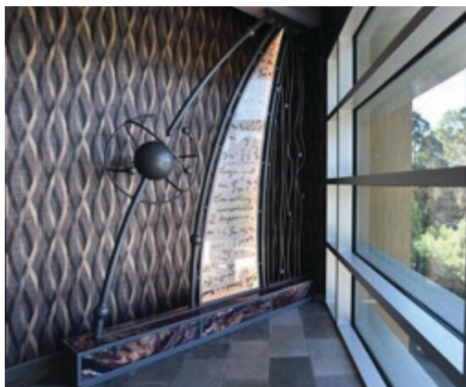
"Something Incredible Happens..." art installation.

These factors were the inspiration for French Hospital Medical Center to apply to the Harold J. Miossi Charitable Trust for grants to install therapeutic art pieces around the hospital campus, in areas such as the Healing Garden and new Copeland Health Education Pavilion. The Miossi Trust responded generously by awarding French Hospital Foundation with two grants totaling $71,000.