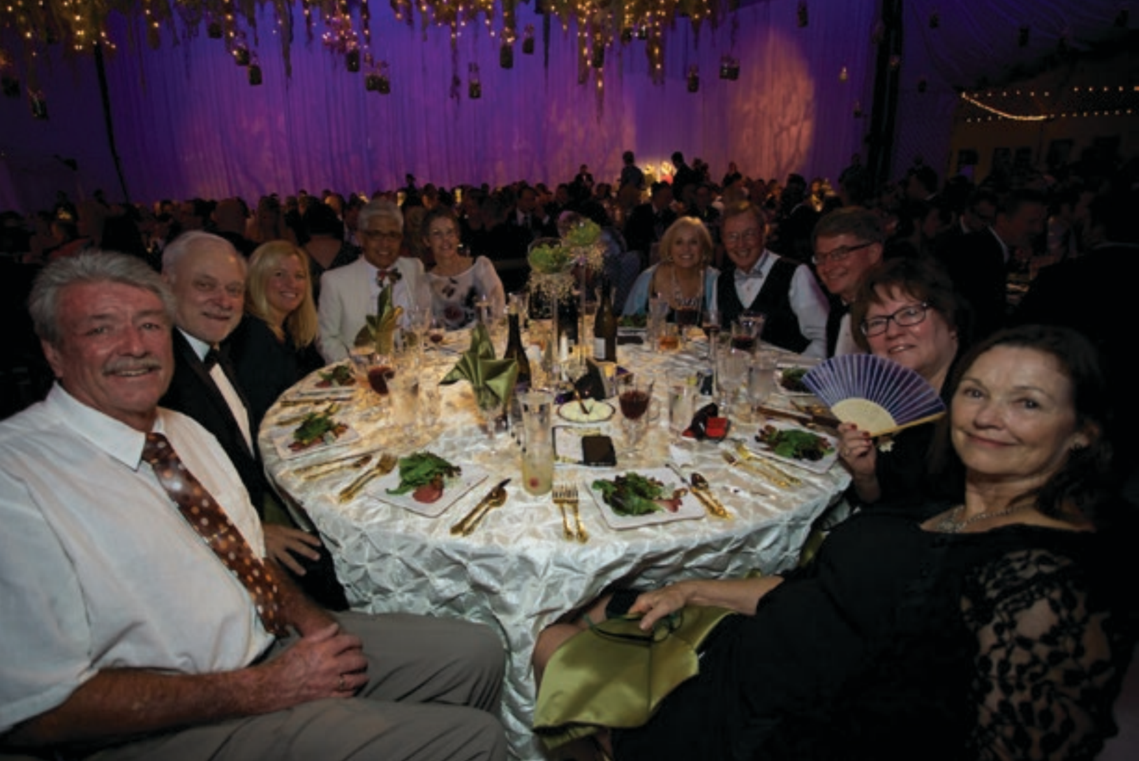
Past Humanitarian Award Winners enjoyed a special table at the Celebration of Caring Gala.