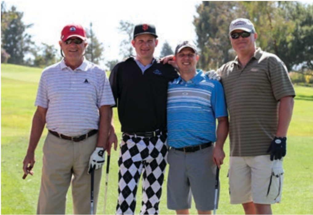
Golfers enjoyed a beautiful day on the course during the French Cup.