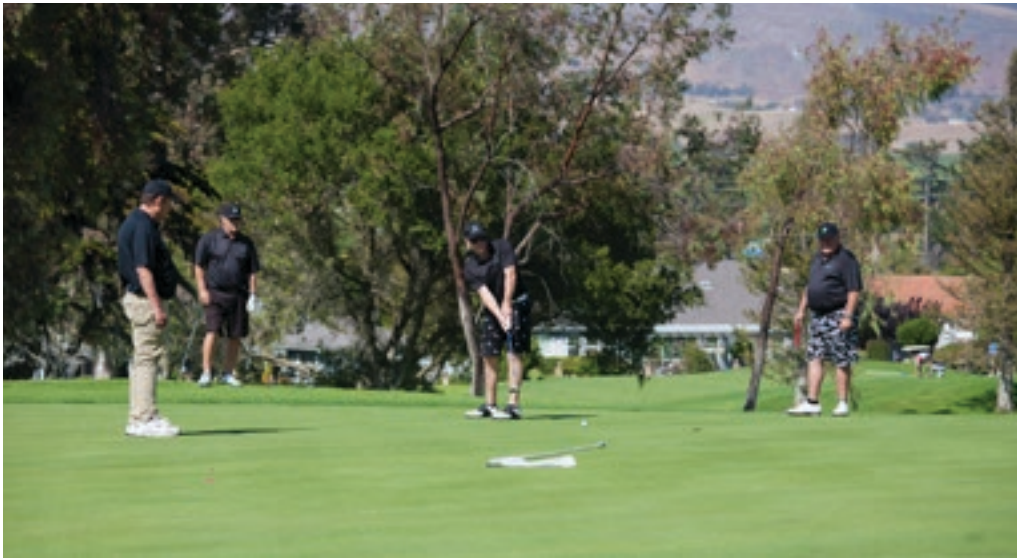
The San Luis Ambulance golf team during the 2016 French Cup.