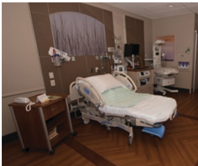
Newly remodeled labor and delivery rooms offer a tranquil setting to welcome new family members.

Partially complete, the project is expected to be finished in early 2017 and is part of the “French – Well into the Future” Capital Campaign, supported by a generous gift from the Stollmeyer and Ryan families, as well as other generous contributors.