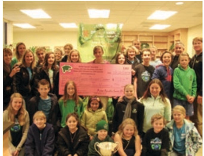
The Puma Aquatic Team presents a check for $11,200 to the Hearst Cancer Resource Center.