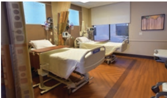
New Physical Therapy Gym (top) and new patient rooms (bottom).

This project was part of the “French – Well into the Future” Capital Campaign and was supported by a grant from the George Hoag Family Foundation and other generous contributors. The new wing includes a dedicated nursing station and seven patient rooms, each with two patient beds. The wing is also home to a new, modern indoor and outdoor Physical Therapy Gym, providing patients with easy access to begin physical therapy.