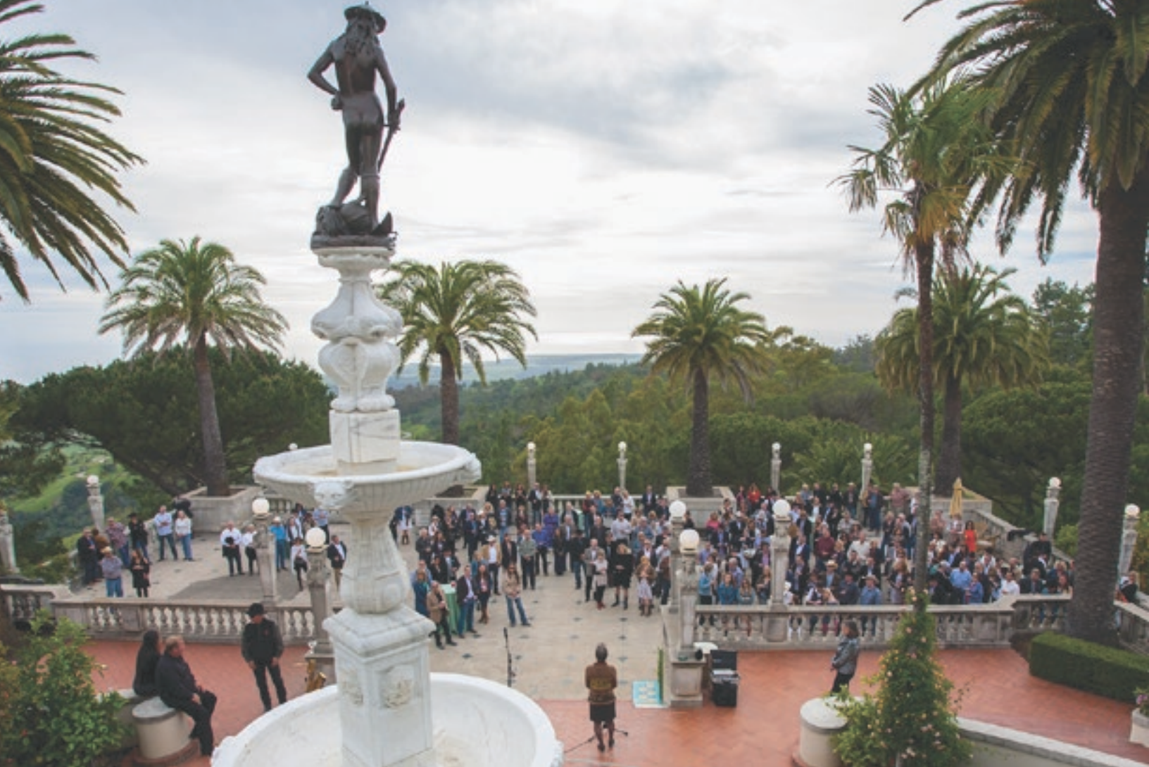
Guests enjoy the view from a stunning terrace at Hearst Castle during Share the Hope.