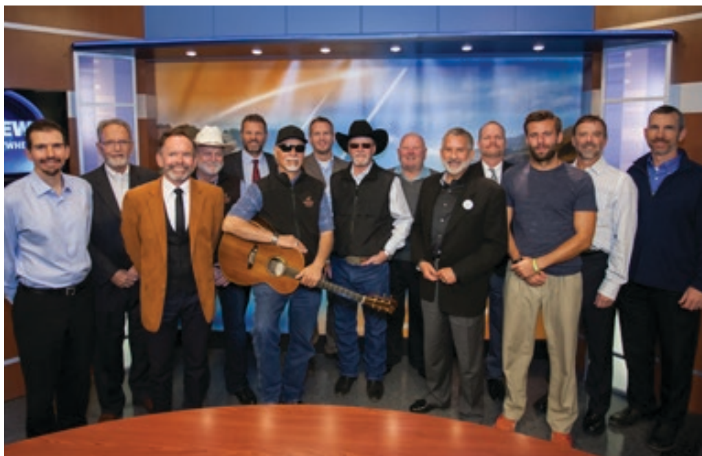
Prominent community members gathered at KSBY to celebrate No Shave November in 2015, benefiting the Hearst Cancer Resource Center.