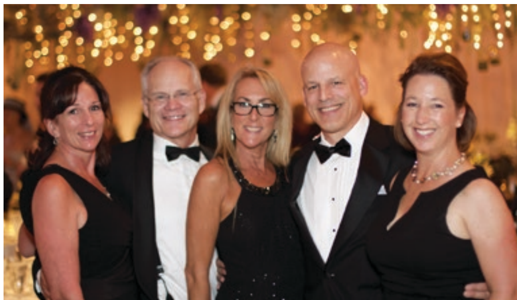
Guests of the Celebration of Caring Gala.

The French Hospital Medical Center Foundation Caring Circle of Donors supports a wide variety of hospital programs. It is our pleasure to recognize and celebrate the generosity of those donors who have invested in their community hospital.