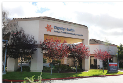
Arroyo Grande Community Hospital