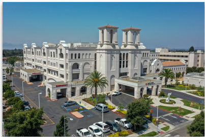
Marian Regional Medical Center