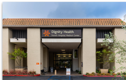
French Hospital Medical Center

Rolling 12M, PHC employed or contracted providers accounted for: