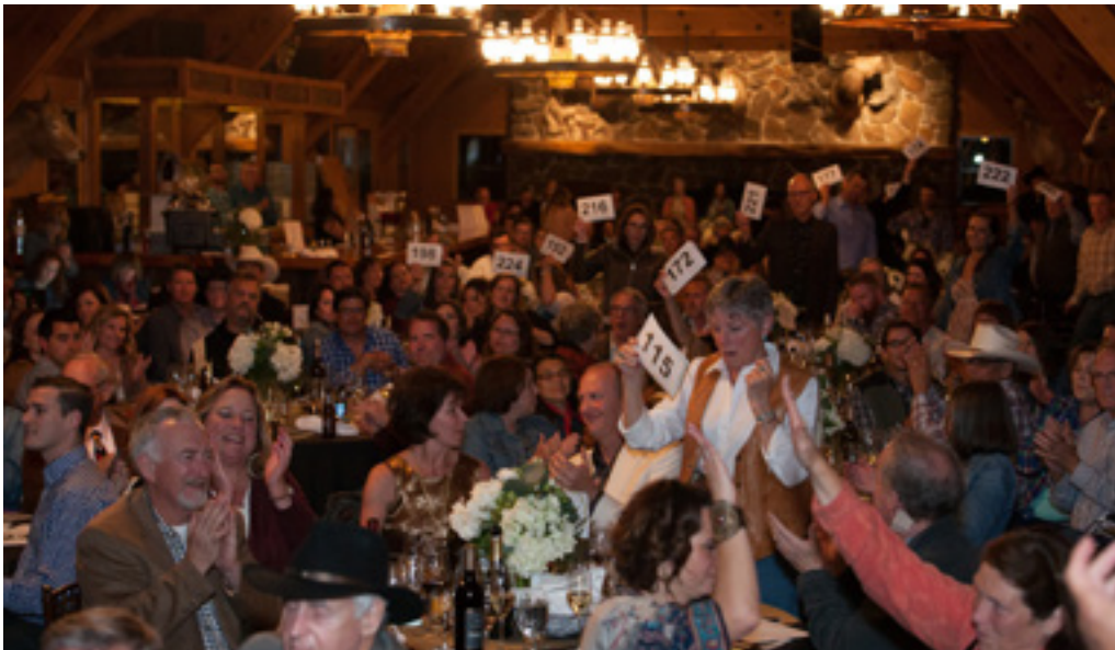
Guests at Share the Hope provided overwhelming generosity during the Call to Action.

The French Hospital Medical Center Foundation Caring Circle of Donors supports a wide variety of hospital programs. It is our pleasure to recognize and celebrate the generosity of those donors who have invested in their community hospital.