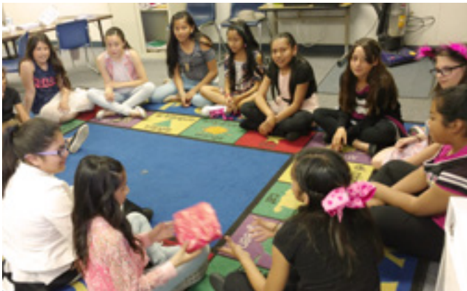
Girls participate in an interactive group exercise during a workshop at a Paso Robles school.

Bombarded by unrealistic images of how the perfect female should look, many girls and women deal with self-esteem and body image issues, feeling bad about themselves and lacking confidence in their abilities. In fact, a significant gender gap in self-esteem exists, one that increases with age. As girls and boys grow up, both experience a loss of self-esteem, but the loss is much more dramatic for girls and poses more long-lasting negative effects.