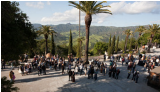
Share the Hope Guests enjoyed magnificent views from Hearst Castle during the champagne reception.