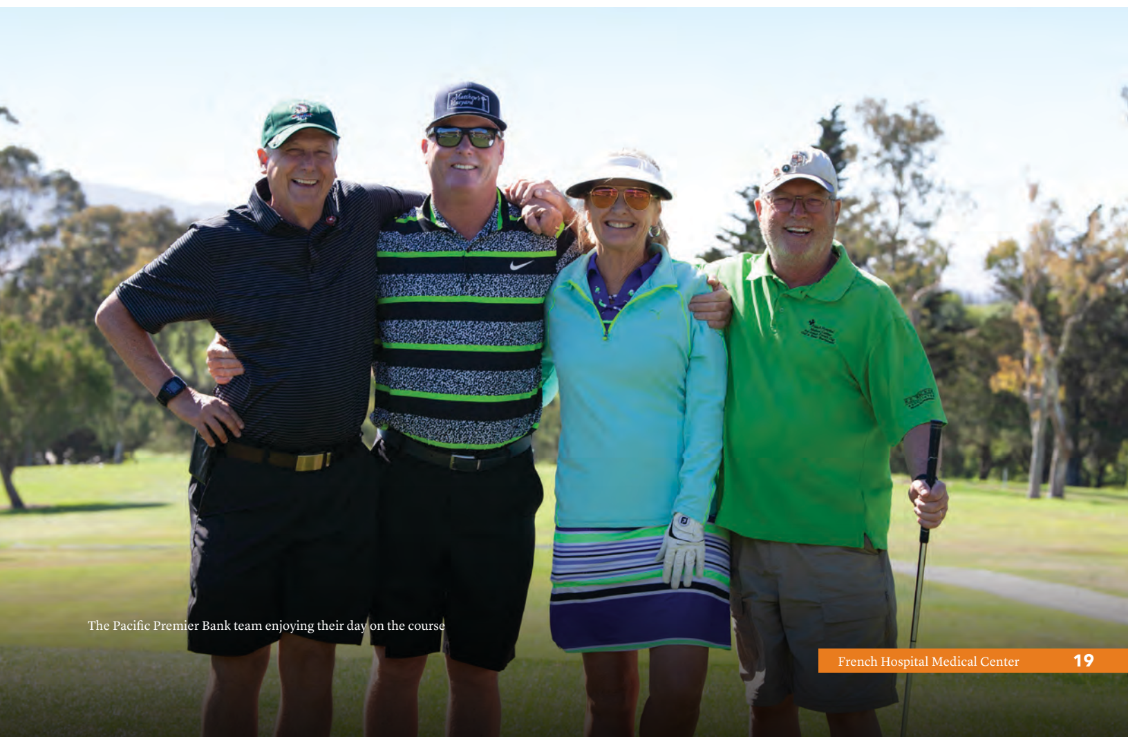
The Pacific Premier Bank team enjoying their day on the course