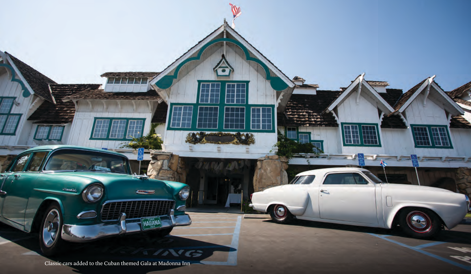
Classic cars added to the Cuban themed Gala at Madonna Inn