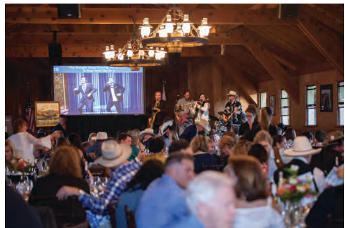
Live music and a live auction accompanied dinner at the Dairy Barn