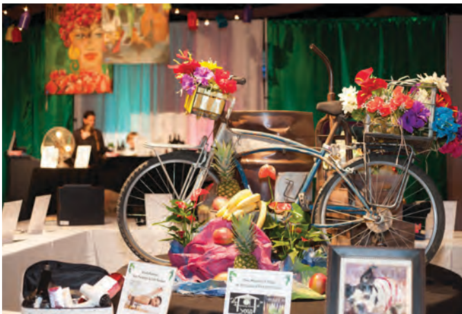
Cuban themed décor at the Gala