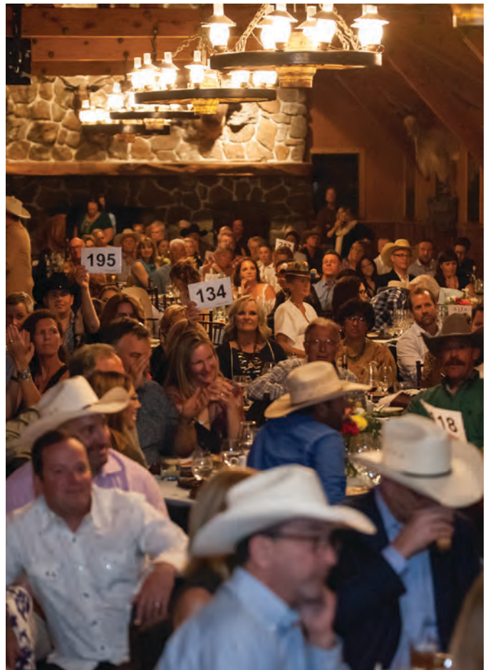
Guests generously supported the Endowment during the Call to Action at Share the Hope