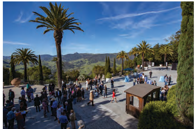
Views from Hearst Castle during Share the Hope