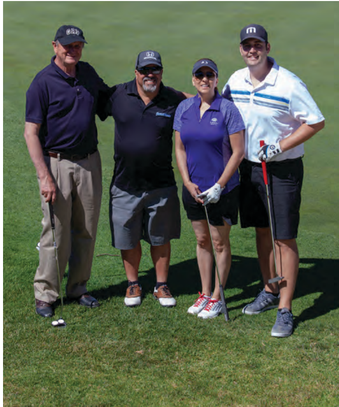
Community West Bank's team at the French Cup