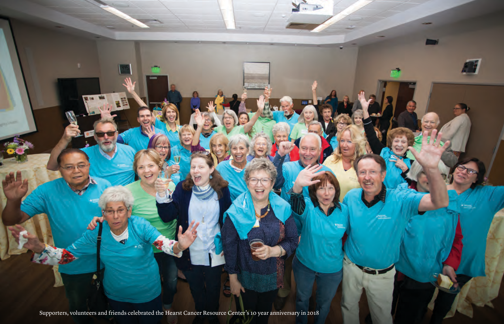
Supporters, volunteers and friends celebrated the Hearst Cancer Resource Center's 10 year anniversary in 2018