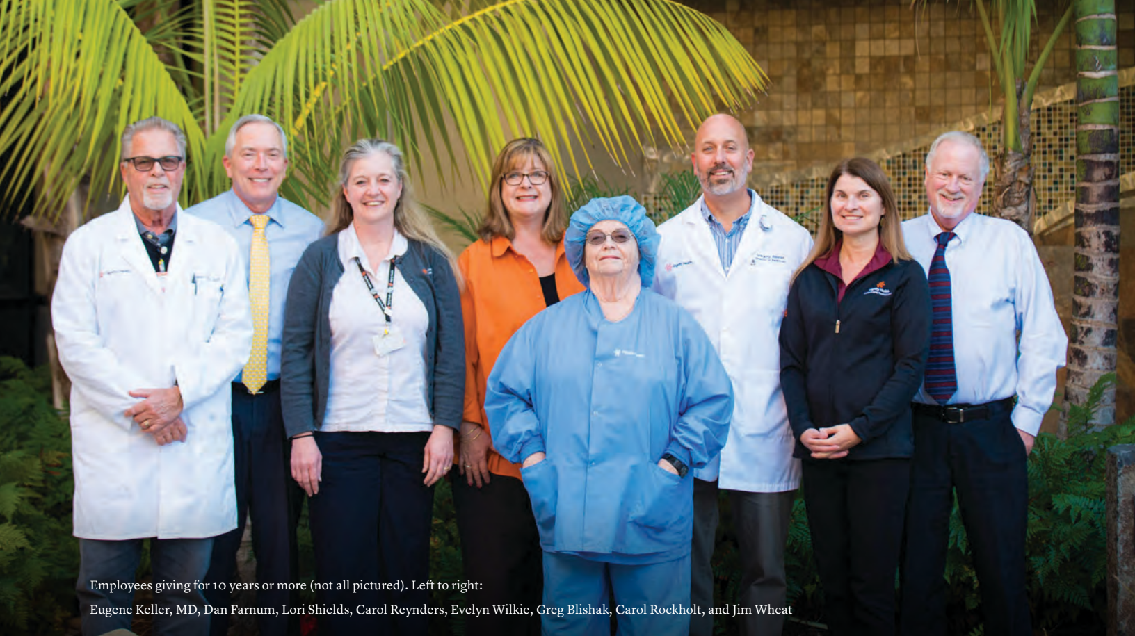
Employees giving for 10 years or more (not all pictured). Left to right: