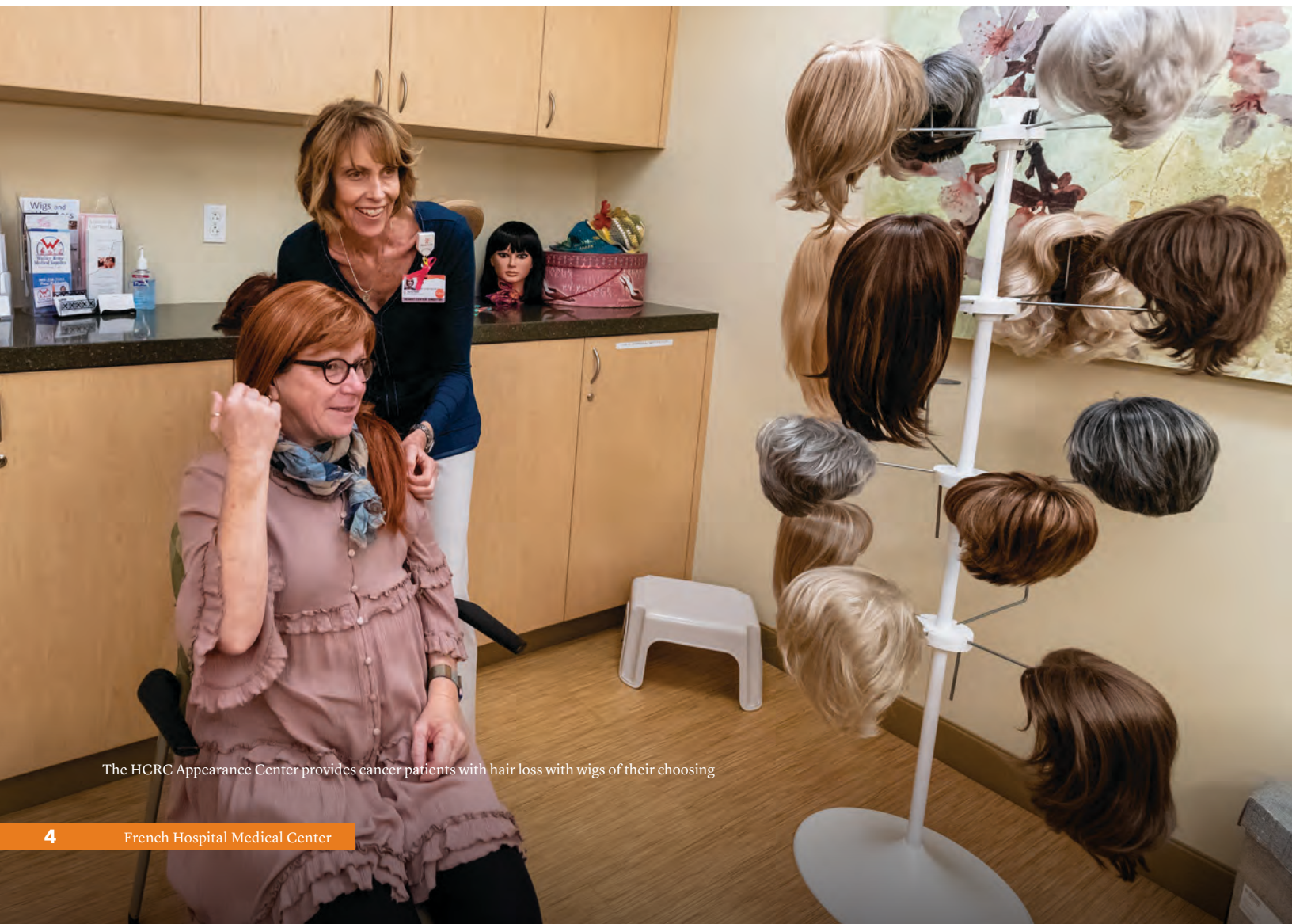
The HCRC Appearance Center provides cancer patients with hair loss with wigs of their choosing

For the past decade, the HCRC has understood the importance of taking a multi-faceted approach to cancer care, offering a host of patient support services designed to help patients find comfort, support, and empowerment when they are most needed. Among the services provided by the HCRC are education, social services and support programs, nutritional counseling, treatment techniques, spiritual and therapeutic social activities, and financial