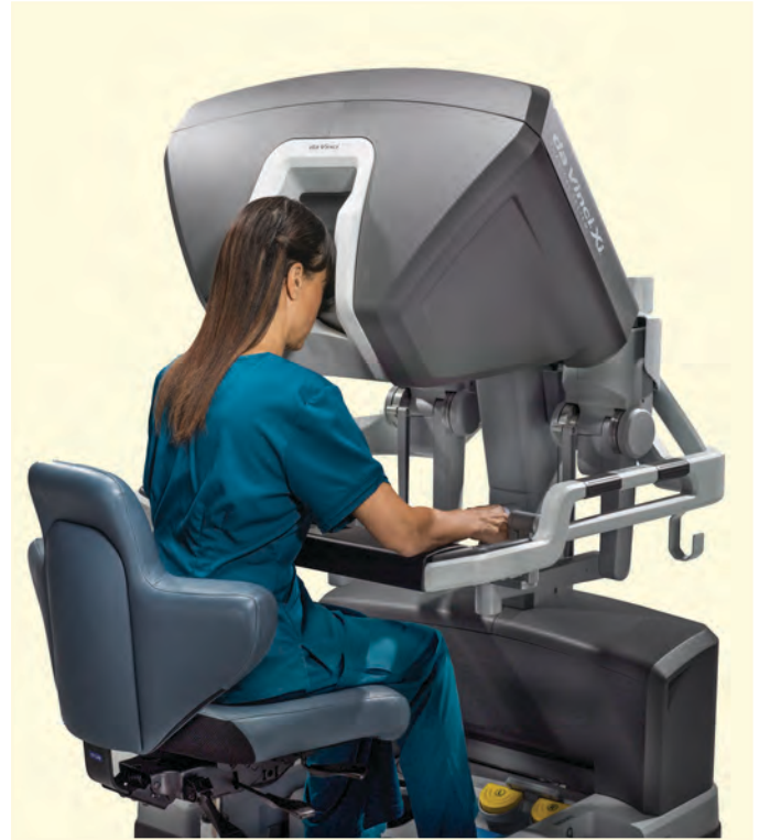
Surgeons control the movements of the da Vinci's robotic arms using an advanced console

To learn how you can support advanced technology, contact the Foundation at 805.542.6496.