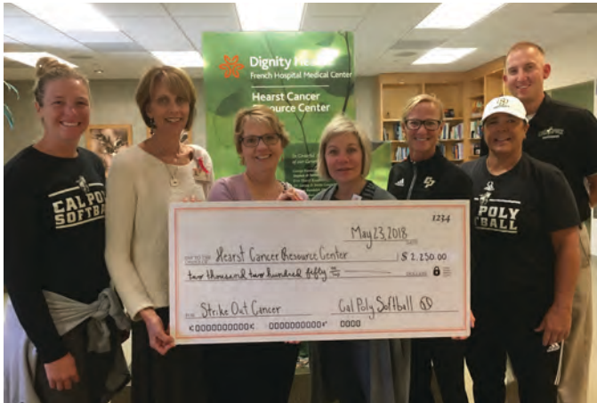
Cal Poly Softball supported the Hearst Cancer Resource Center with their 'Strike Out Cancer' event