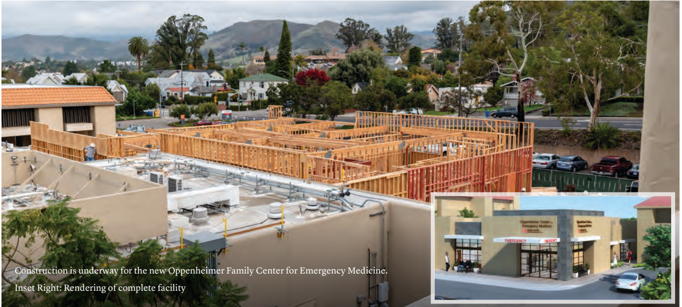
Construction is underway for the new Oppenheimer Family Center for Emergency Medicine. Inset Right: Rendering of complete facility

The most advanced emergency services center in San Luis Obispo will soon open its doors at French Hospital Medical Center.