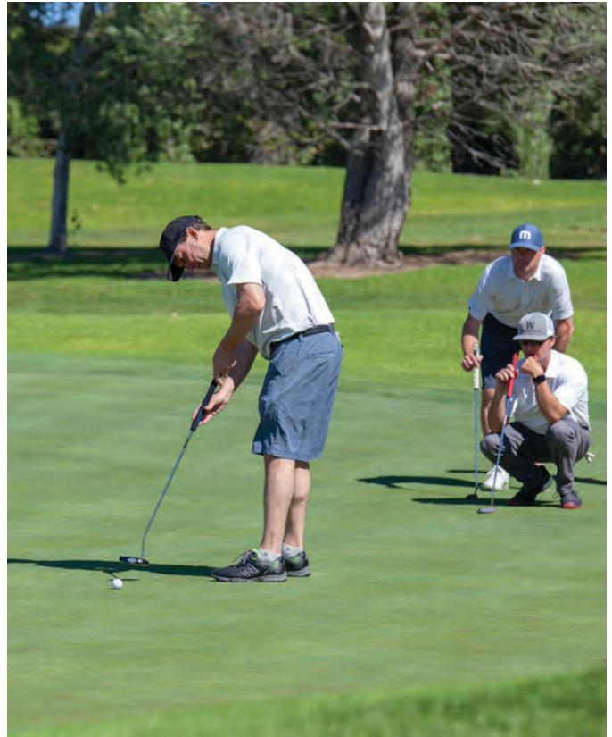
Sunset Honda's team hoping to sink their putt