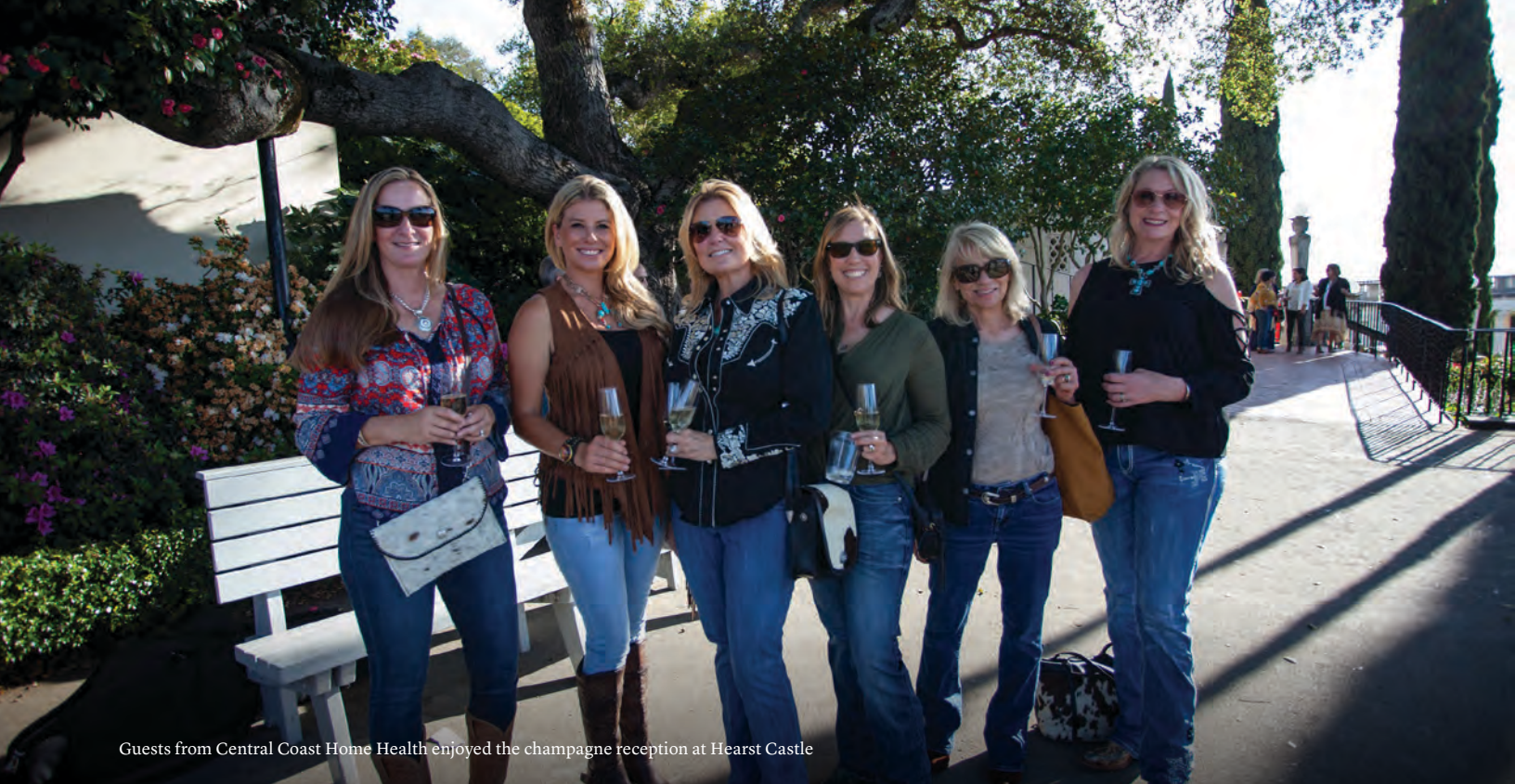
Guests from Central Coast Home Health enjoyed the champagne reception at Hearst Castle