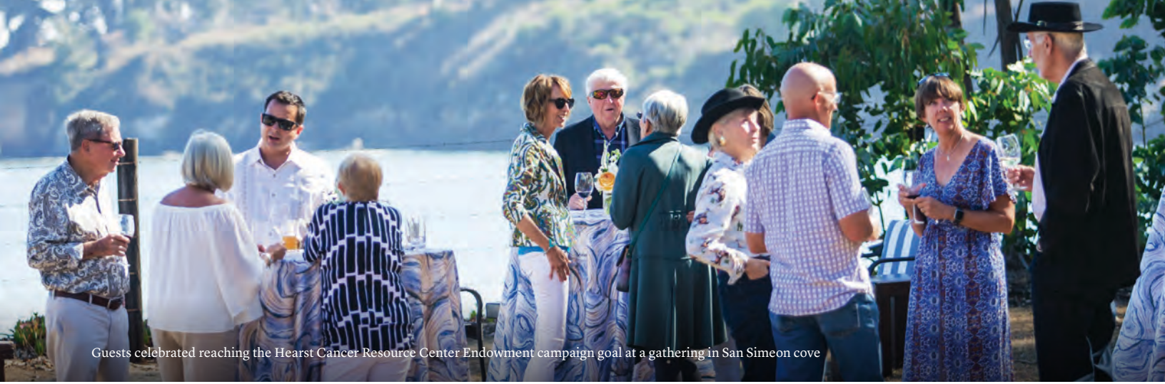
Guests celebrated reaching the Hearst Cancer Resource Center Endowment campaign goal at a gathering in San Simeon cove