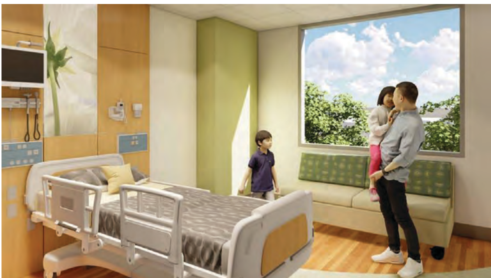
Private rooms will provide patients with an environment of healing

The advances of Your New French Hospital will set new standards in health care and redefine the patient experience in San Luis Obispo County today and for generations to come.