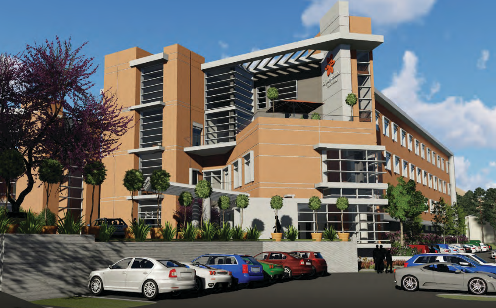
A new four-story patient care tower will provide a new hospital entrance, private patient rooms and much more